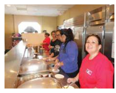
Volunteers at the Someone Cares Soup Kitchen.