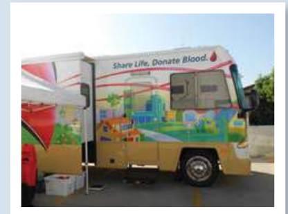
The credit union partners with PIH Health for a community blood drive.