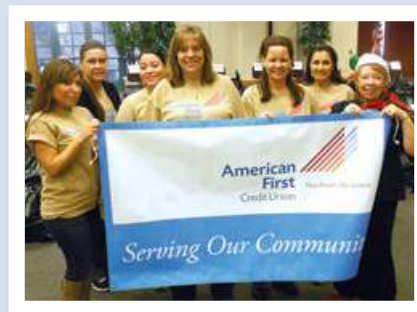
Associates volunteer at Operation Santa distributing food and toys to underprivileged families.