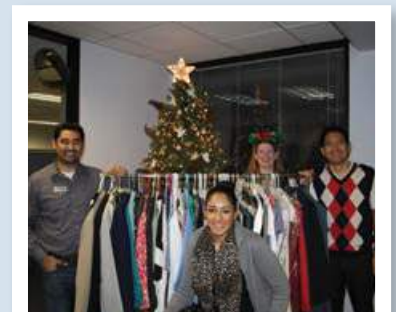
Associates and members donate clothing to Women Helping Women/Men 2 Work for job placement services.