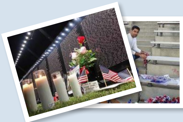
Volunteers work directly with the City of La Habra to welcome the "Wall That Heals" Vietnam Veteran's Memorial.