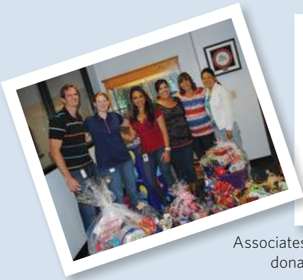
Associates raffle off charity baskets with the proceeds being donated to Children's Hospital of Orange County.