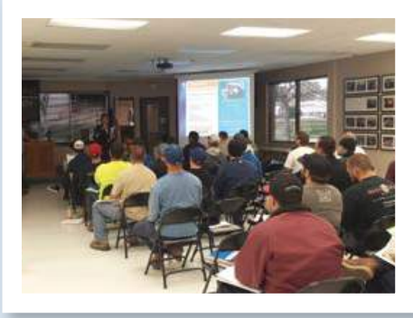
Associates meet with local Select Employer Groups for educational workshops and membership drives.