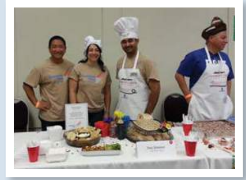
Associates raise money for the Children's Museum of La Habra with a winning entry in the Gourmet Guys cook-off.