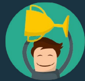
To be announced Q4 Winner