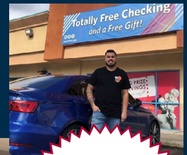
Car Buying Services