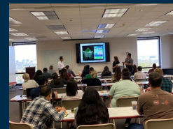
Home Buying Workshops

amerfirst.org/JoinUs/SelectEmployeeGroups