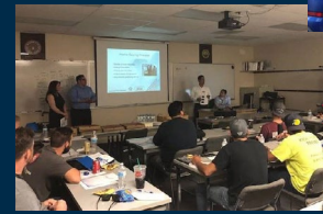
Money Wise Workshops