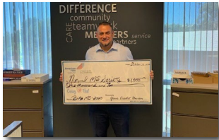
Bike MS: Virtual Bike Ride

The last quarter of 2020 brought about many opportunities for American First to demonstrate the 'People Helping People' initiative. We found ways big and small to support our cherished foundations. Through virtual walks, bike-a-thons, online fundraisers, a drive-thru toy drive and more, we came together to raise over $25,000 to give back and make sure our presence was felt in our communities.