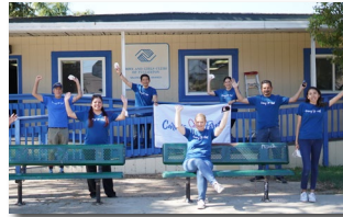
Boys and Girls Club: Renovating a Classroom