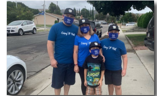
CHOC Children's: Virtual Walk in the Park