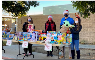
Boys and Girls Club: Drive-Thru Toy Drive