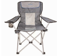
Escalade™ Folding Chair Available 7/12-8/29