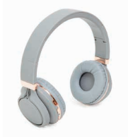
Sentry® Headphones Available 4/12-5/30