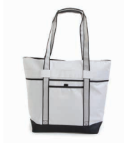
Brentwood® Cooler Tote Available 5/31-7/11